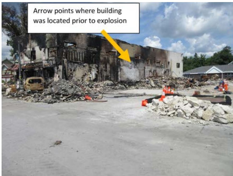
Photo 2. Site of explosion. Note the building/origin of the explosion was destroyed during the blast (NIOSH Photo)