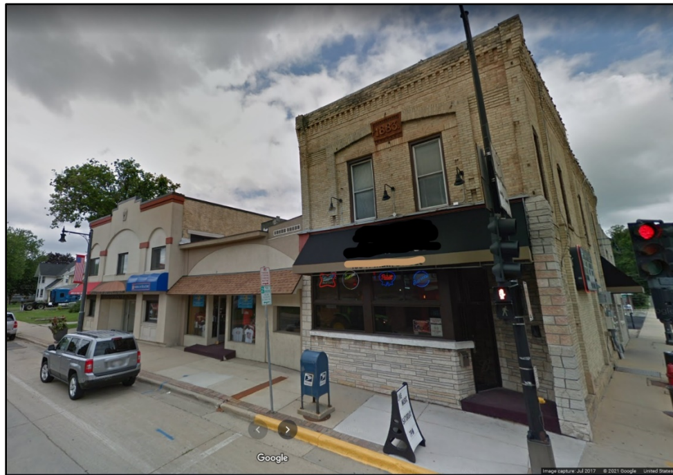
Photo 1. Side Alpha of Pub prior to explosion.