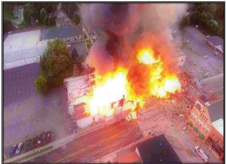
Site of Natural Gas Explosion